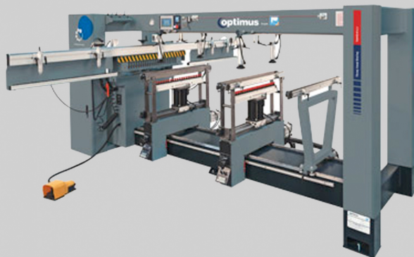
MULTI BOARING 4 HEAD