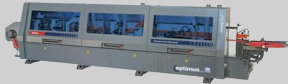
EDGE BANDING MACHINE